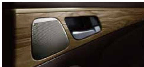
Haman entertainment system & 10-speaker HIFI stereo