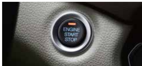
Second generation PEPS keyless entry and one button starts