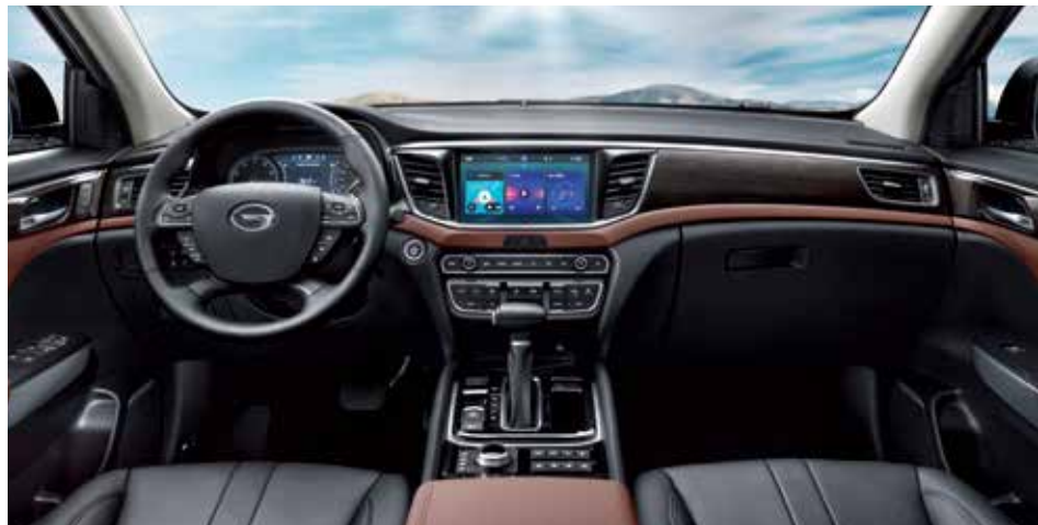
10-inch LCD central control screen