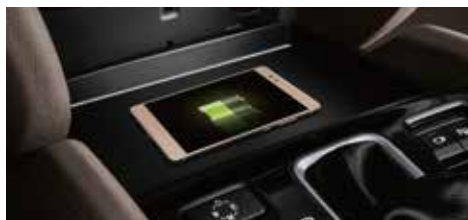
Mobile phone wireless charging function