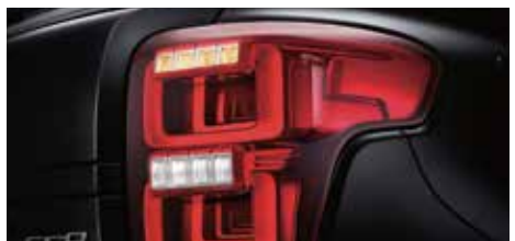
GPS voice navigation system